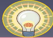
ESF 12 ENERGY Public Service Commission and Florida Energy and Climate Commission