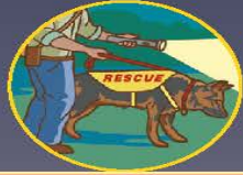
ESF 9 SEARCH AND RESCUE Department of Financial Services, Division of State Marshal