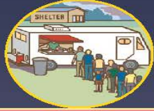
ESF 6 MASS CARE Department of Business and Professional Regulation, Department of Children and Families