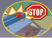
ESF 16 LAW ENFORCEMENT AND SECURITY Department of Law Enforcement