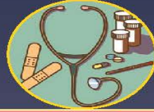
ESF 8 HEALTH AND MEDICAL Department of Health