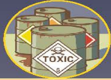
ESF 10 HAZARDOUS MATERIALS AND ENVIRONMENTAL PROTECTION Department of Environmental Protection