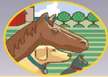
ESF 17 ANIMAL AND AGRICULTURAL ISSUES Department of Agriculture and Consumer Services