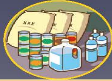
ESF 11 FOOD AND WATER Department of Agriculture & Consumer Services