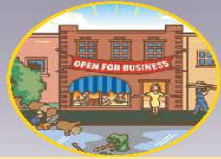
ESF 18 BUSINESS, INDUSTRY AND ECONOMIC STABILIZATION Office of Tourism, Trade, and Economic Development and Department of Revenue