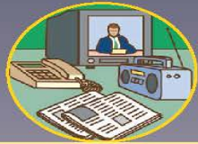
ESF 14 EXTERNAL AFFAIRS Division of Emergency Management, Executive Office of the Governor