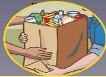
ESF 15 VOLUNTEERS AND DONATIONS Governor's Commission on Volunteerism and Community Service (Volunteer Florida)