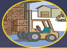
ESF 7 RESOURCE MANAGEMENT Department of Management Services, Division of Purchasing