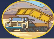
ESF 3 PUBLIC WORKS AND ENGINEERING Department of Transportation