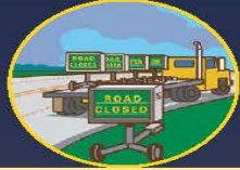
ESF 1 TRANSPORTATION Department of Transportation