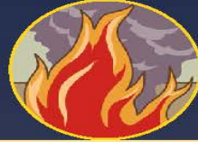
ESF 4 FIREFIGHTING Department of Financial Services, Division of State Fire Marshal