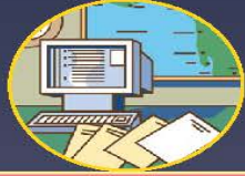
ESF 5 PLANS Division of Emergency Management